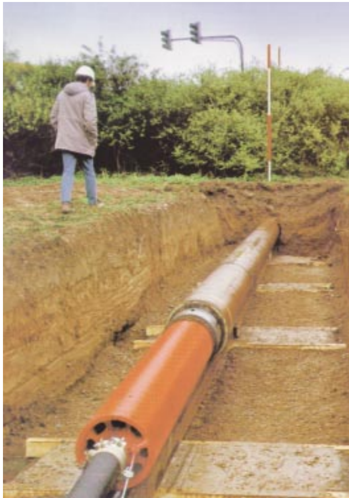
Installation of a steel casing by a pneumatic ramming hammer

As with impact moling, thorough ground investigation is an essential requirement of pipe ramming projects. Large obstacles can deflect a pipe off course, or may damage the cutting edge, causing a steering bias. As there is usually no means of monitoring the direction of the pipe during a bore, it is vital to establish a clear bore path prior to work commencing.