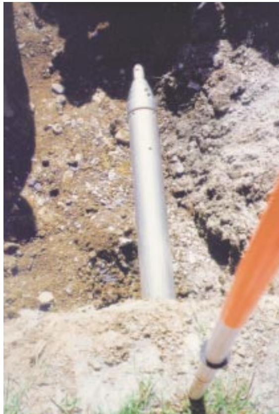
Arrival of impact mole

To overcome the problem, installation is often done using a liner film within the pipeline. Exhaust air deposits the oil film on the liner which is removed on completion of the bore, leaving a clean inner surface. To avoid the need for a liner, moles have become available which vent used compressed air from the front of the machine. This air then discharges along the outside of the new pipe, without affecting the inner surface.