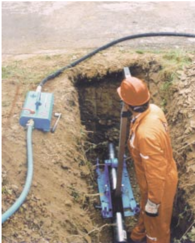
Impact Moling and Ramming

The compacting action of the impact mole means that, in general, it can operate only in soils that can be compressed or displaced. Obstacles along the bore path can deflect or stop the mole, so a thorough ground investigation regime is essential prior to work commencing, in order to establish a clear route. This should include not only knowledge of existing utilities, but also soil sampling to ensure that cobbles or boulders are unlikely impede progress. Some impact mole designs have been developed to try to overcome unexpected obstacles or even relatively small known ones.