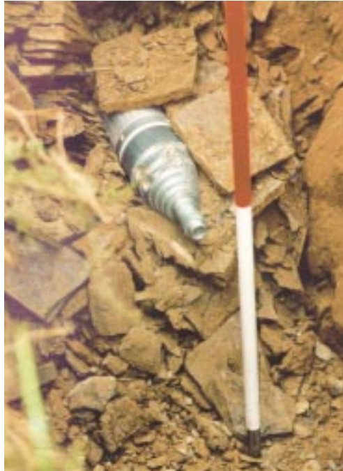
Impact mole merging at reception pit

A launch pit and a reception pit are first excavated at the ends of the bore path, to a little over the planned depth of the installation. The launch cradle, if used, is then set up, or the mole can be positioned directly on the floor of the launch pit. Using a ranging rod in the reception pit and a sighting telescope in the launch pit, the initial line of the bore is established by physically aiming the mole towards the ranging rod target. The mole is launched and allowed to advance a short distance. The line is checked for a final time before the whole of the body of the mole enters the ground. If the line is not correct, the bore is restarted. The bore is completed when the mole arrives at the reception pit, and the tool can be removed after the product pipe, duct or cable has been drawn into the pit.