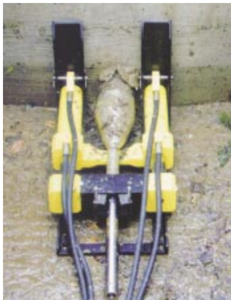
Bursting head and hydraulically powered rod pulling machine