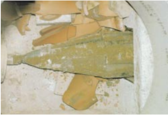
Hydraulic mole emerging at reception chamber